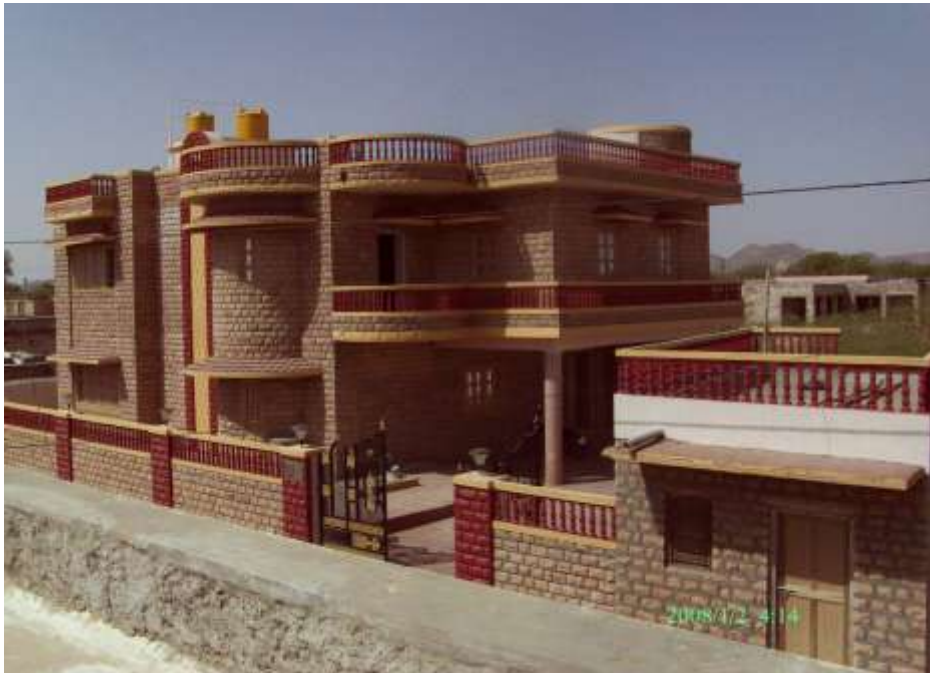
JANGID HOUSE BARMER RAJASTHAN