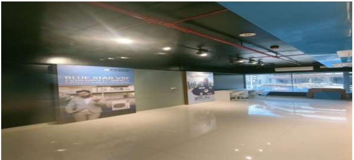
VRF CENTER PANJIM GOA , M/S BLUESTAR PVT LTD (2022)