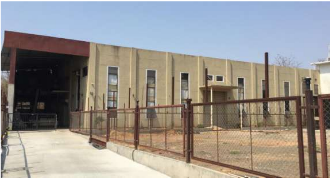
OUR MODULER FACTORY