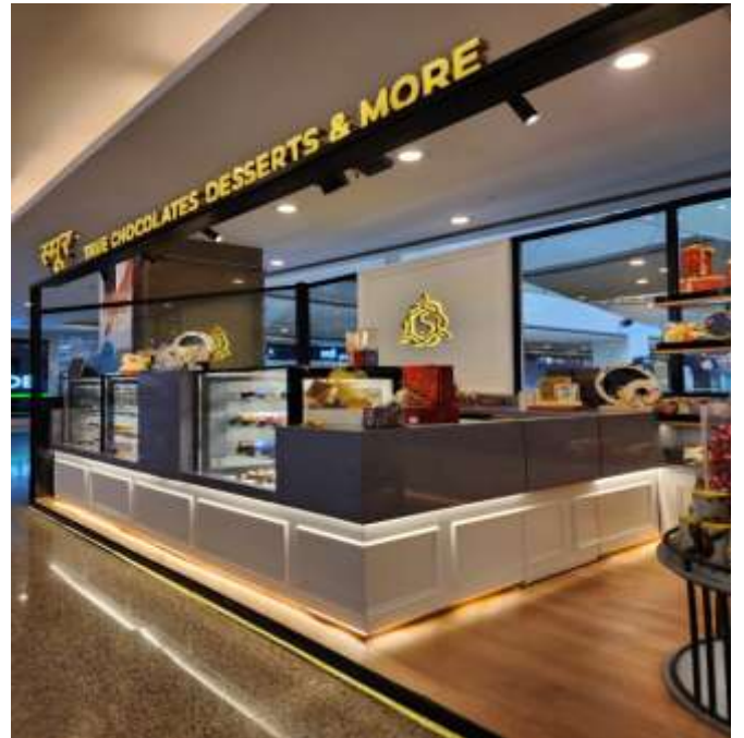
SMOOR THE CHOCOLATES & DESSERTS INFINITY MALL MALAD-MUMBAI M/S BLISS CHOCOLATES