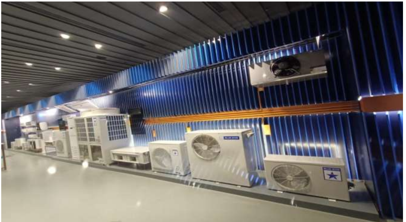
BLUESTAR EXPERIENCE CENTER THANE - MAHARASHTRA